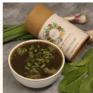
Spinach Onion Soup