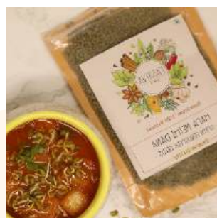
Hara Methi Sprouts Soup