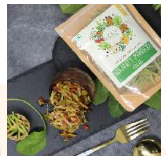
Palak Mangodi Stirfry