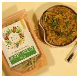
Palak Mangodi Khichdi