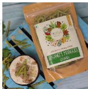
Tadkedar Mangodi Raita