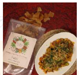
Rabodi ki chaat