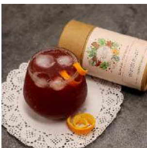
Beetroot Ginger Delight