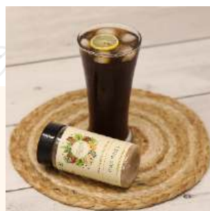
Masala Coke Mocktail