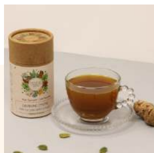
Ginger Turmeric Tea