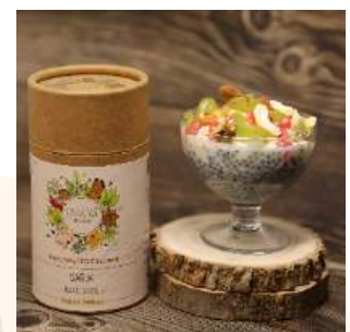
Fruits and Basil Seeds Ice-cream