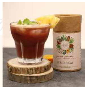
Pineapple Beetroot Punch