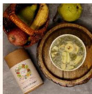
Wheatgrass Power Breakfast