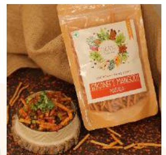
Veggie Masala Mangodi