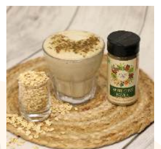
Oats Buttermilk Soda