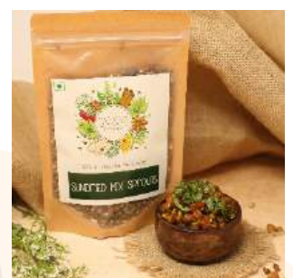
Sundried Sprouts Mix Sabji