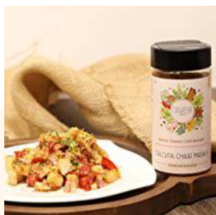
Khatta Aloo Kata