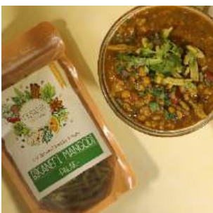
Dal with Palak Mangodi