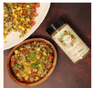
Sprouts & Corn Chaat