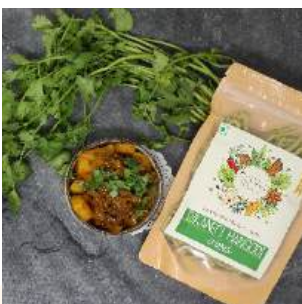
Aloo Dhania Mangodi ki