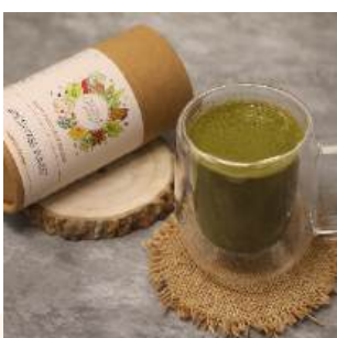
Ginger Wheatgrass Tea