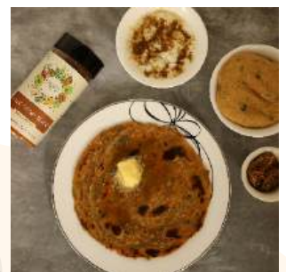
Garlic Coriander Paratha