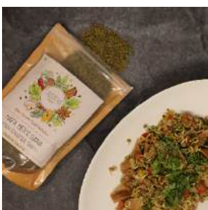
Sprouted Methi with Rabodi