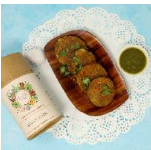
Kurkuri Spinach Tikki