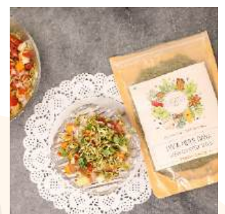
Hara Methi Sprouts Salad