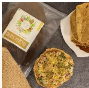
Khichia ki Chaat