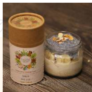
Basil Seeds 'n' Oats Jar