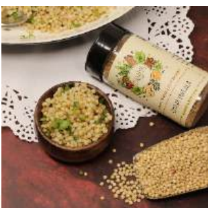
Tender Jowar Chaat