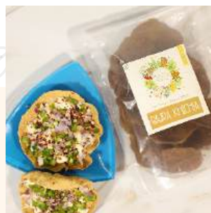
Chilli Cheese Khichia