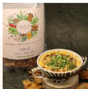
Kadhi Rabodi chaat