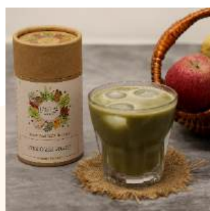
Green Goodness Smoothie