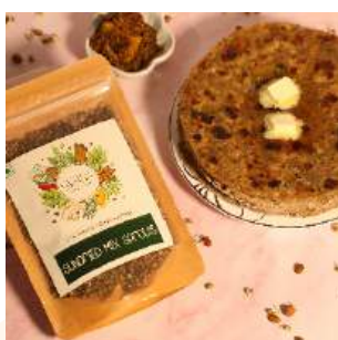
Dry Sprouts Paratha