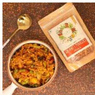
Masala Mangodi Sprouts Sabji