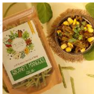
Palak Mangodi Corn