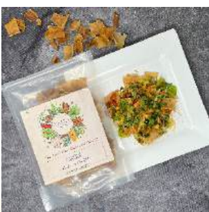
Rabodi Stir Fry