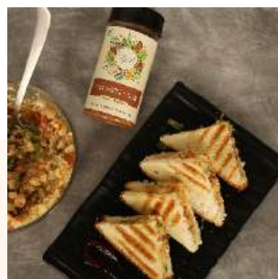
Spicy Vegetable Sandwich