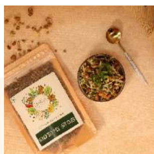
Sativik Sprout Salad (No onion/garlic)