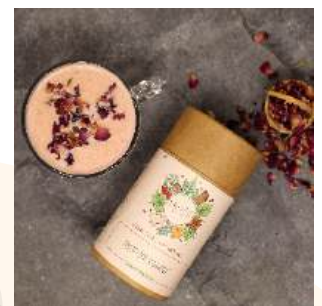
Pink Moon Milk