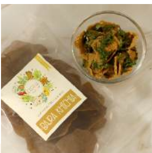
Khichia ki Churi