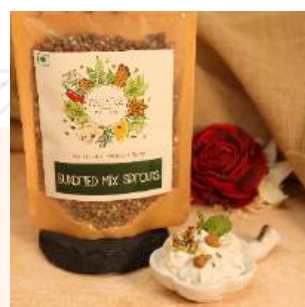
Sprouted Hung Curd