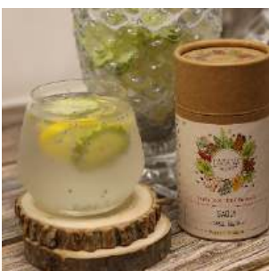
Cucumber and Sabja Detox Drink