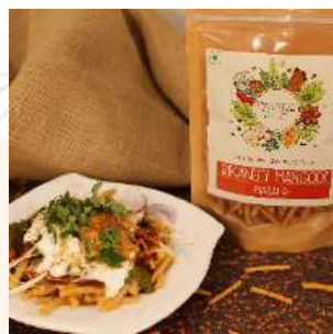
Dahi Chaat Mangodi