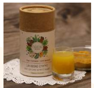
Tangy Turmeric Shot