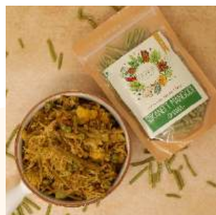
Dhania Mangodi Rice