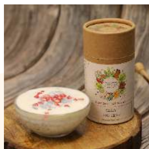
Fruity Sabja Yogurt