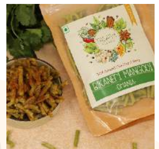
Dhania Mangodi Chatpati Chaat