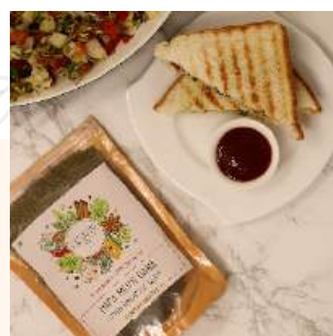
Chatpata Hara Methi Sprouts Sandwich