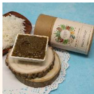
Spinach Chatpata Chutney